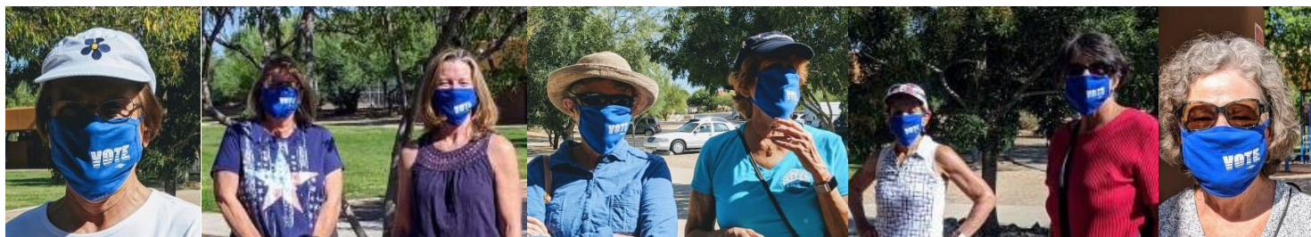
Indivisible Tucson Action Alliance members supporting Democrats of Oro Valley Vote Blue Mask Project

Finally, we still have some blue VOTE tee-shirts available, and you will be sartorially resplendent wearing it with your matching blue VOTE facemask. Contact Tom at tmeconi@sbcglobal.net to make arrangements to get yours.