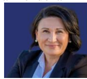
JoAnna Mendoza AZ Senate